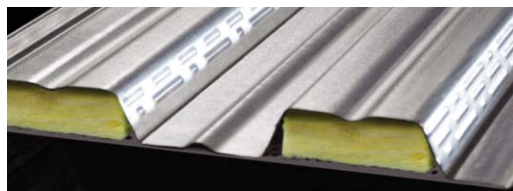
Type 2" Composite Cellular Acoustical Type Shown

Type 2" composite cellular deck is utilized in exposed ceiling areas where a flat bottom deck is desired for aesthetic purposes under a slab and the spans exceed the capability of type 1-1/2" composite cellular deck.